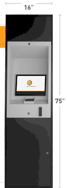
AP – 1